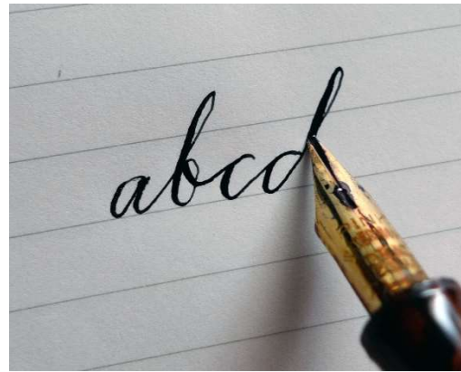
Image: An experienced writer possesses a huge cognitive basis of many specific action trajectory shapes (left). Lots of abstract cognitive knowledge concerning inflection points within one action trajectory shape provides the possibility to connect letters in very miscellaneous ways (right).