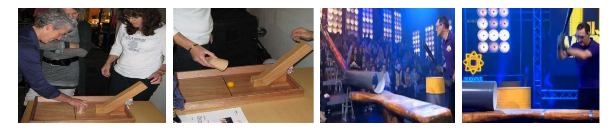
Images: The motoric movement action cat and mouse game is known within two sizes. A small, room size, version (images left) and a big, game show and event size, version (images right).

Within the final part of this article the motoric movement action cat and mouse game is briefly addressed. It has already been appointed extensively in relationship to the explanatory model and is available at the internet at several locations.