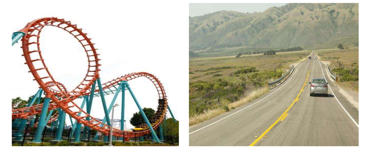
Image: Within every imaginable marble run the actual position of every imaginable marble, as the front (!) and leading part of the manifest action trajectory shape, needs to be perceived permanently to optimally update the perceptual image of the still latent part that implicitly arises out of the manifest shape.

With the aforementioned revelation the perception-action dichotomy can be finalized at once because the explanatory model shows crystal clear that they both are obligatory needed in a compelling relationship within an overarching phenomenon and the latter shows that they hardly have any meaning without each other. The perception of the actual position of the marble at the front of the manifest action trajectory shape is obligatory to be able to actualise the perceptual image of the latent part, which the manifest part implicitly shapes, in an optimal way because also a marble will be able to deviate at any random point P (for example in time) within a marble run shape. This actualisation process then needs to be followed within the creation of the latent part of the action trajectory shape because at that moment it is the best (!) representation c.q. the best presumption how the future action trajectory shape will look like which the marble most likely is going to follow/fill. Just like it is formulated within the ball trajectory shape within tennis. The tennis ball is situated at the front of the ball trajectory shape but is also destined to follow the perceptual image of the latent part which implicitly arises from the manifest part. So in other words within every motoric movement action the (movement) action object is caught within a line which is unequivocally present within the marble run.